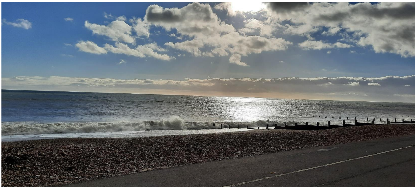
Beach at Bognor Regis

May the grace of our Lord Jesus Christ, the love of God and the fellowship of the Holy Spirit be with us all now and evermore. Amen